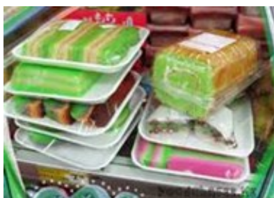
Cakes on Sale after the Lunch Service

Menu subject to change and pictures are for illustrations purposes only