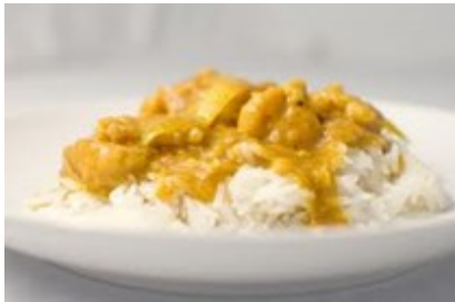
Chicken Curry and Rice