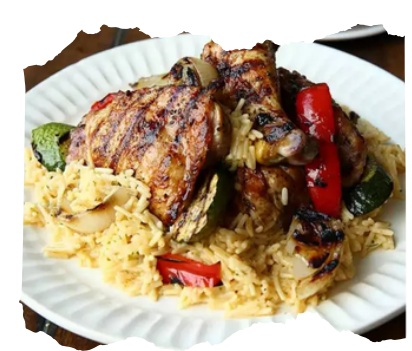
Roasted Chicken and Rice