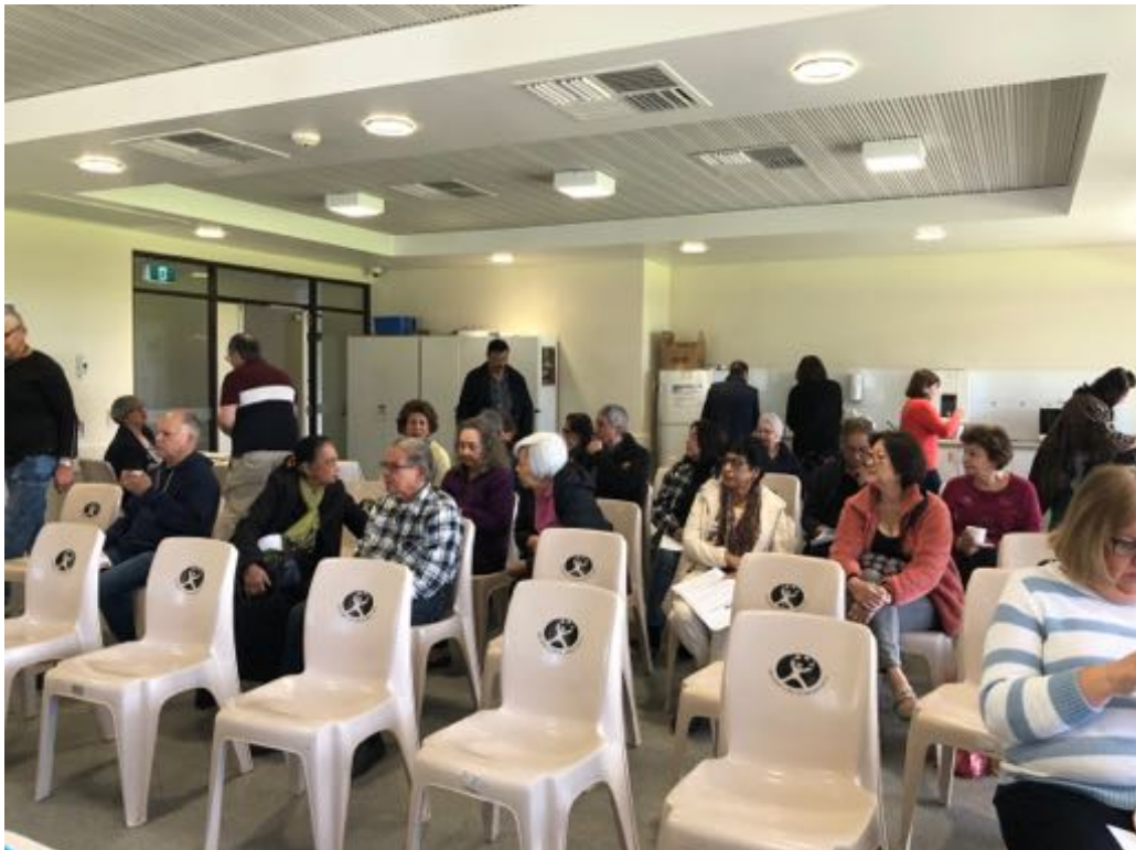
The AGM was well attended - some of the early bird attendees.