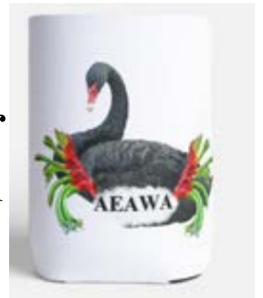
Stubby Holder $10 each