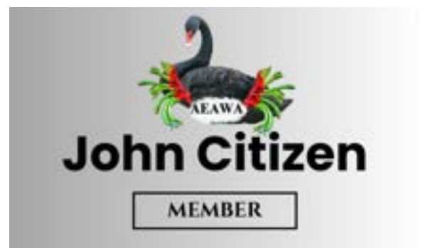
Personalised Club Badge $4 each