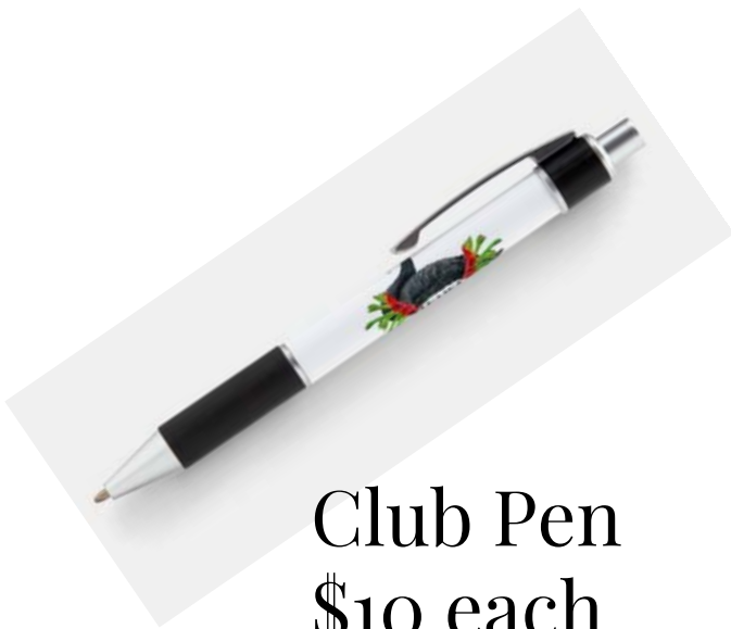
Club Pen $10 each