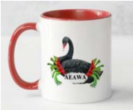
Coffee Mug $15 each